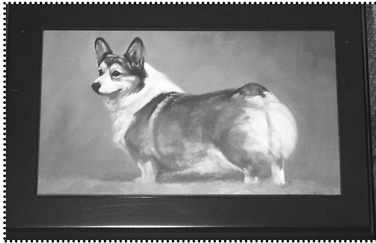
Gorgeous Corgi Music - Jewelry Box Beautiful, One of a Kind Piece